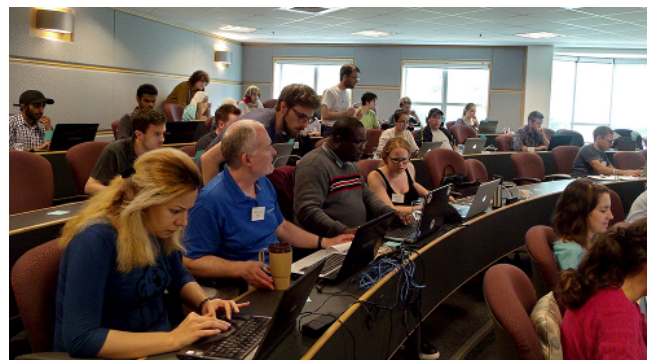
Learners and teaching assistants in action during the Saint Mary's Software Carpentry Bootcamp.

The bootcamp consisted of short tutorials alternating with hands-on practical exercises; learners worked on their own laptops and each had a working software environment by the time the bootcamp was completed. The primary areas covered by the bootcamp were the Unix shell (and how to automate repetitive tasks), Python (and how to grow a program in a modular, testable way), and Git and GitHub (version control software that allows one to track software or document development and share work efficiently). A pre-assessment survey of the registered learners, provided by Software Carpentry, allowed the teaching team to customize the material to the needs of the learning community.