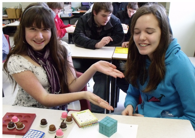
High school students celebrating their problem solving success